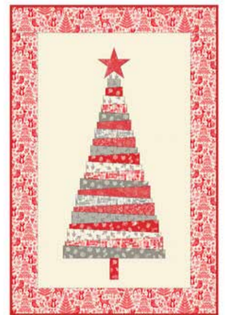
Scandi Red and Grey