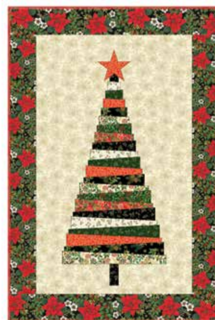
Deck The Halls