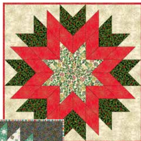
Deck The Halls