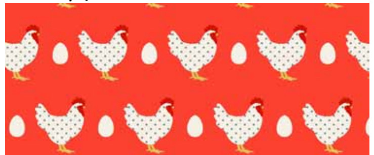
* 1566/R HENS