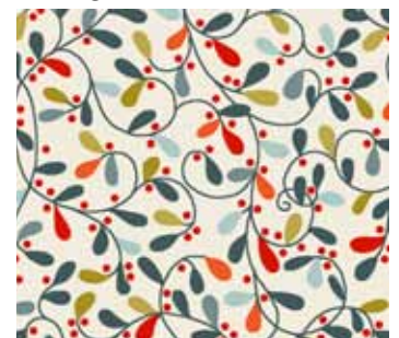
* 1569/Q LEAVES